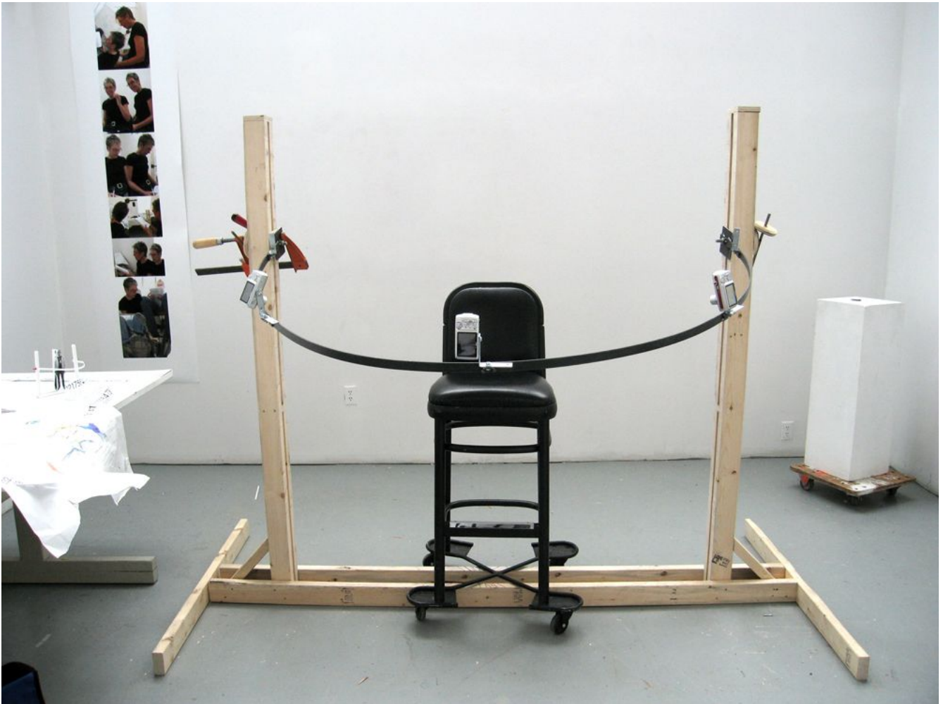
Version 1.1.0 at Banff Centre for the Arts, Banff, Alberta, 2009

Video Monitor, 4-channel generated sound track, generated photographic database animations, metal sheeting, digital prints.